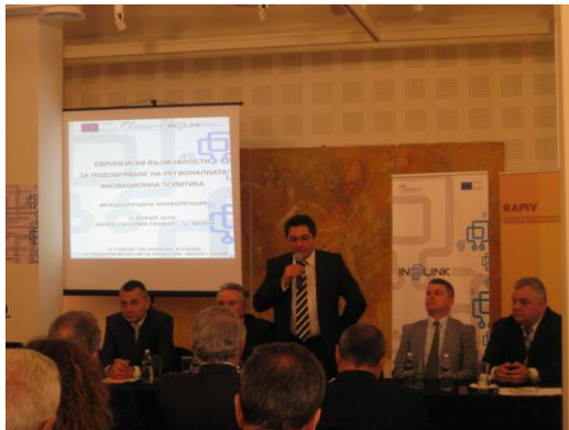
Official opening of the International Conference: Mr. Nikolay Nankov, Deputy Minister Ministry of Regional Development and Public Works

The main objective of the action was to present successful European practices for support of the innovations in order to present a proposal for their inclusion in the Bulgarian Regional Policy.