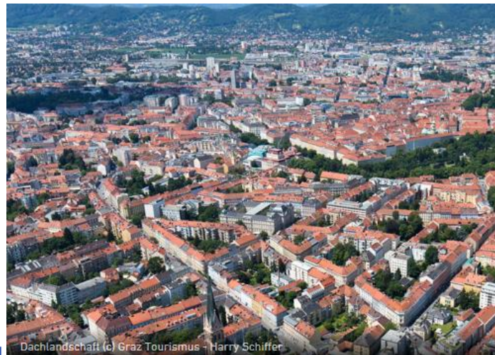
Dachlandschaft